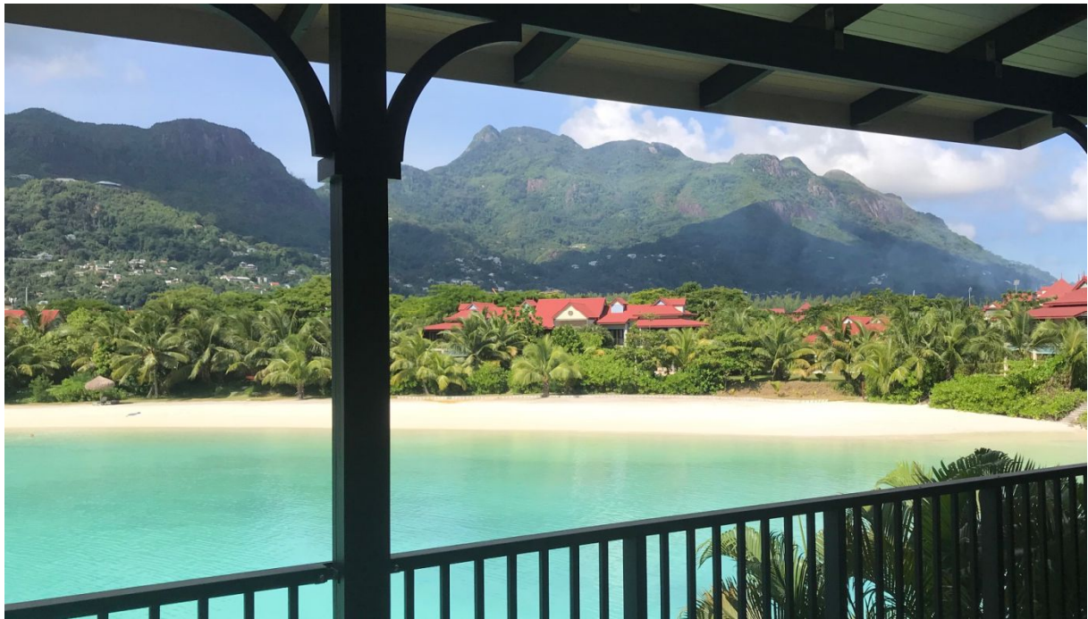
Boat mooring location

(5% Stamp duty, 1.5% Sanction Application Processing Fee, 1.5 % Notary Fee)