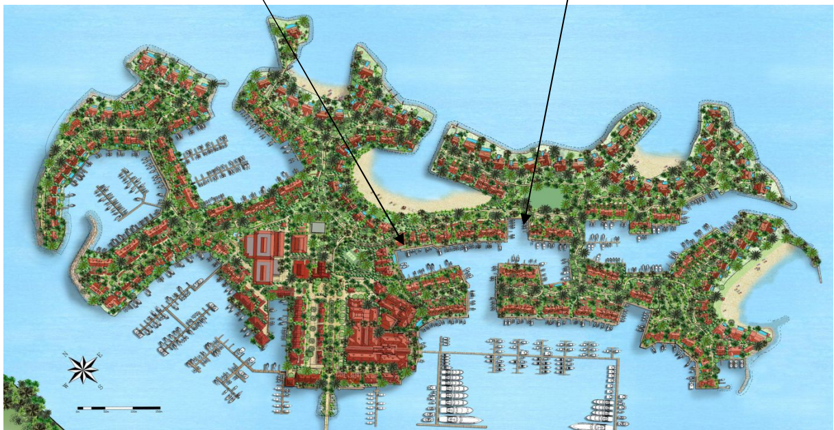
Boat mooring location