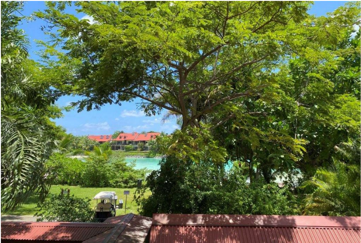
Anse Bernik beach in front of the apartment house