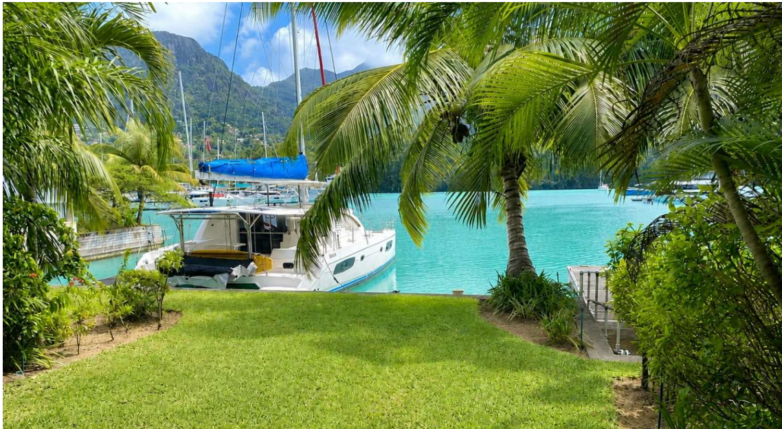
Apartment and boat mooring location

(5% Stamp duty, 1.5% Sanction Application Processing Fee, 1.5 % Notary Fee)