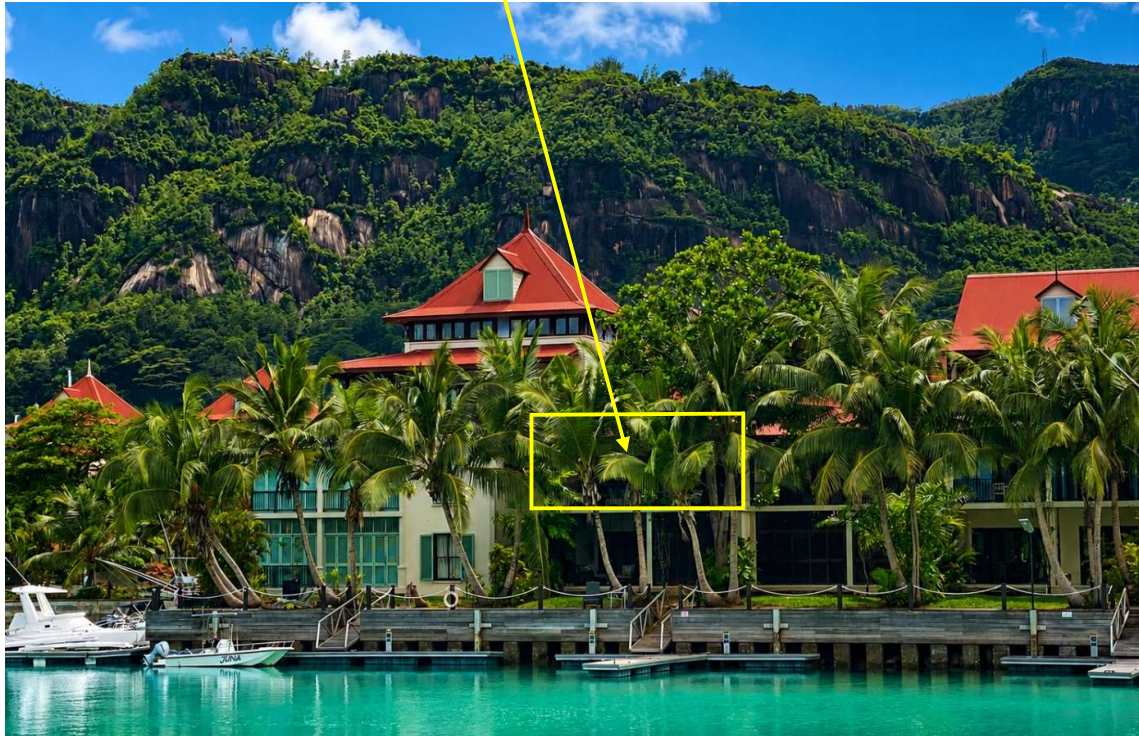
Private boat mooring at the apartment house