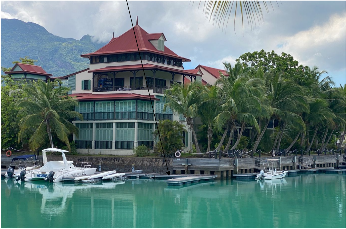
Anse Bernitier beach (approx. 3 minutes walk from the apartment house)