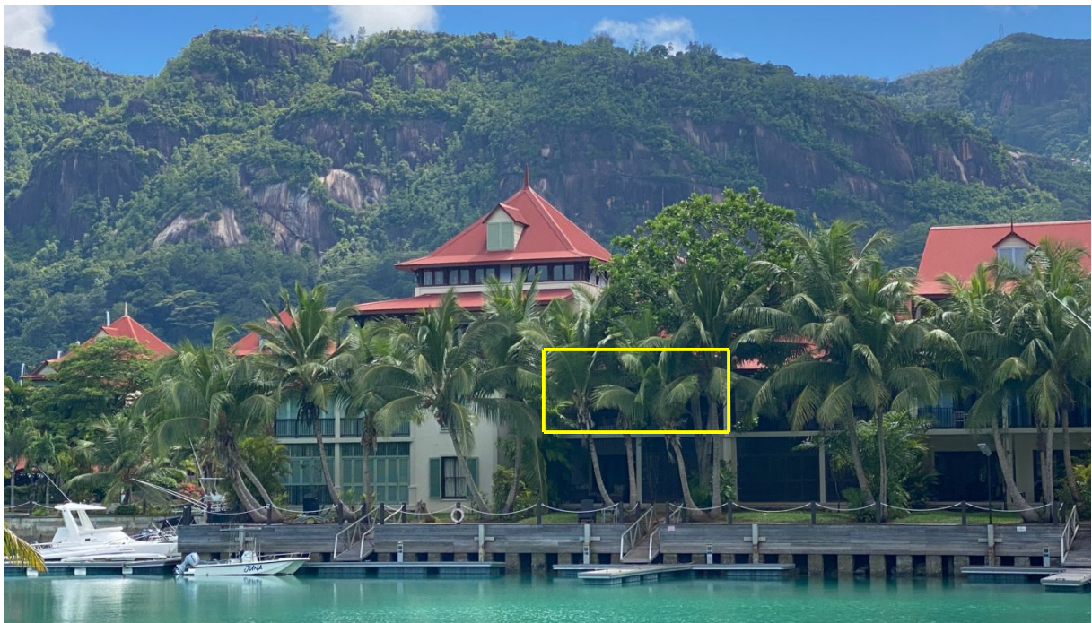
Apartment and boat mooring location

(5% Stamp duty, 1.5% Sanction Application Processing Fee, 1.5 % Notary Fee)