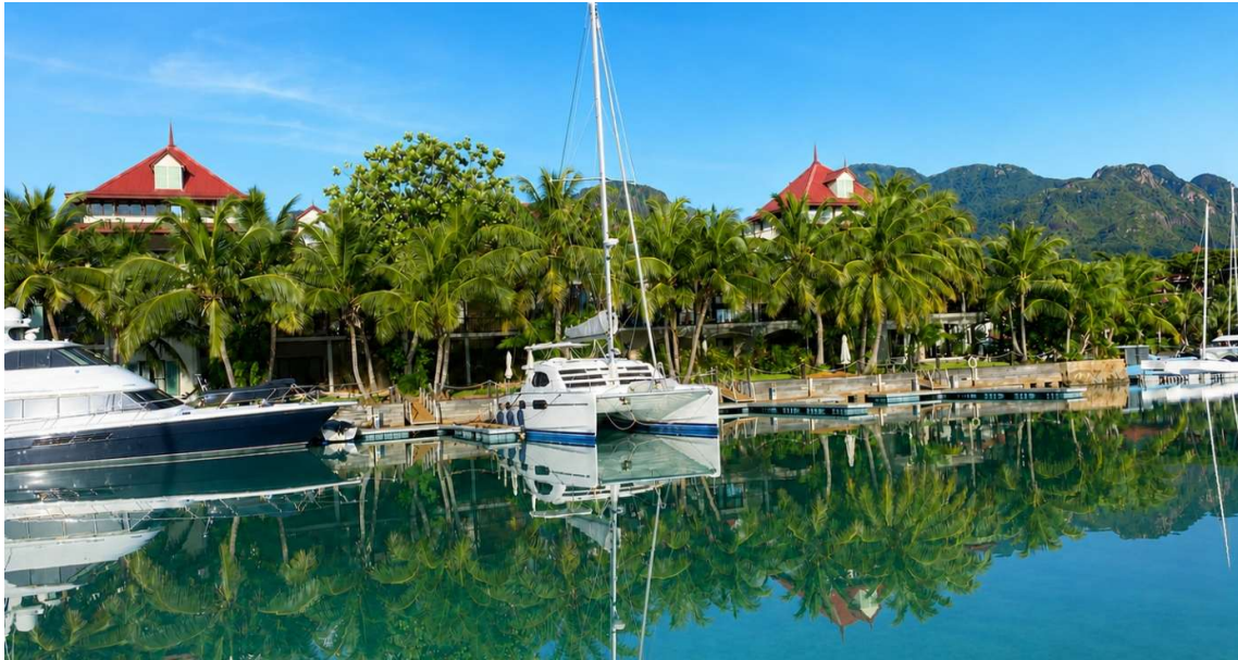
Apartment and boat mooring location

Price: USD 480,000 (incl. furniture) + transfer taxes (5% Stamp duty, 1.5% Sanction Application Processing Fee, 1.5 % Notary Fee)