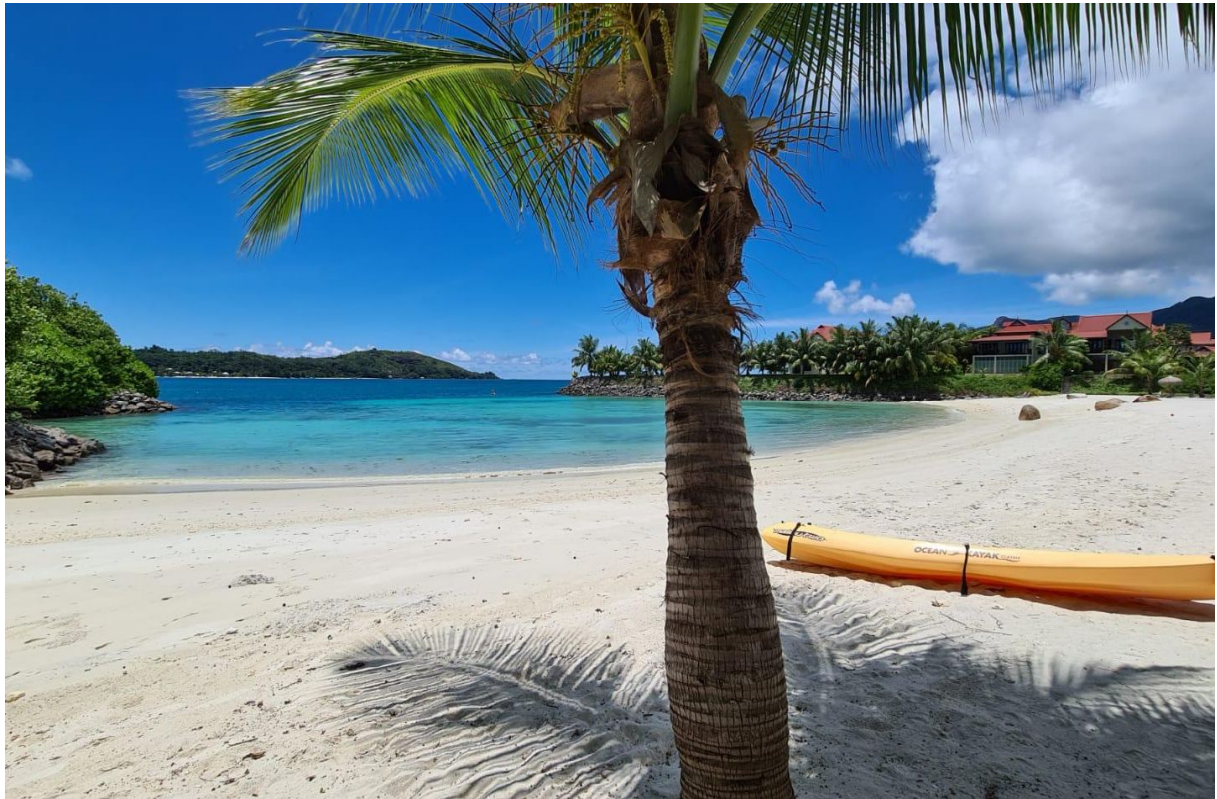
Anse Bernik beach (approx. 5 minutes walk from the apartment)