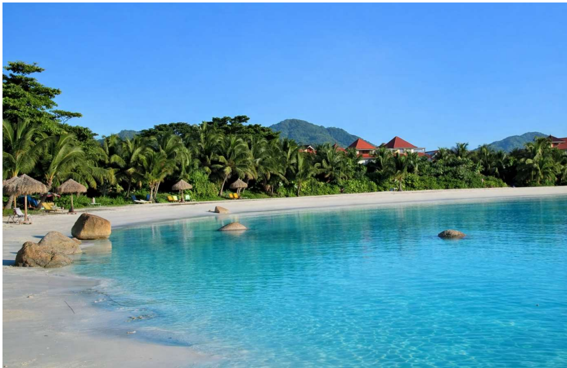
Anse Bernitier beach (approx. 3 minutes walk from the apartment house)