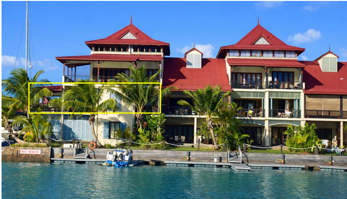
Apartment and boat mooring location

Price: USD 795,000 (incl. furniture) + transfer taxes (5% Stamp duty, 1.5% Sanction Application Processing Fee, 1.5 % Notary Fee)