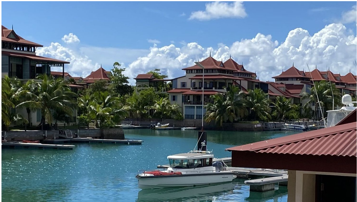
Apartment and boat mooring location

Price: USD 615,000 (incl. furniture) + transfer taxes (5% Stamp duty, 1.5% Sanction Application Processing Fee, 1.5 % Notary Fee)