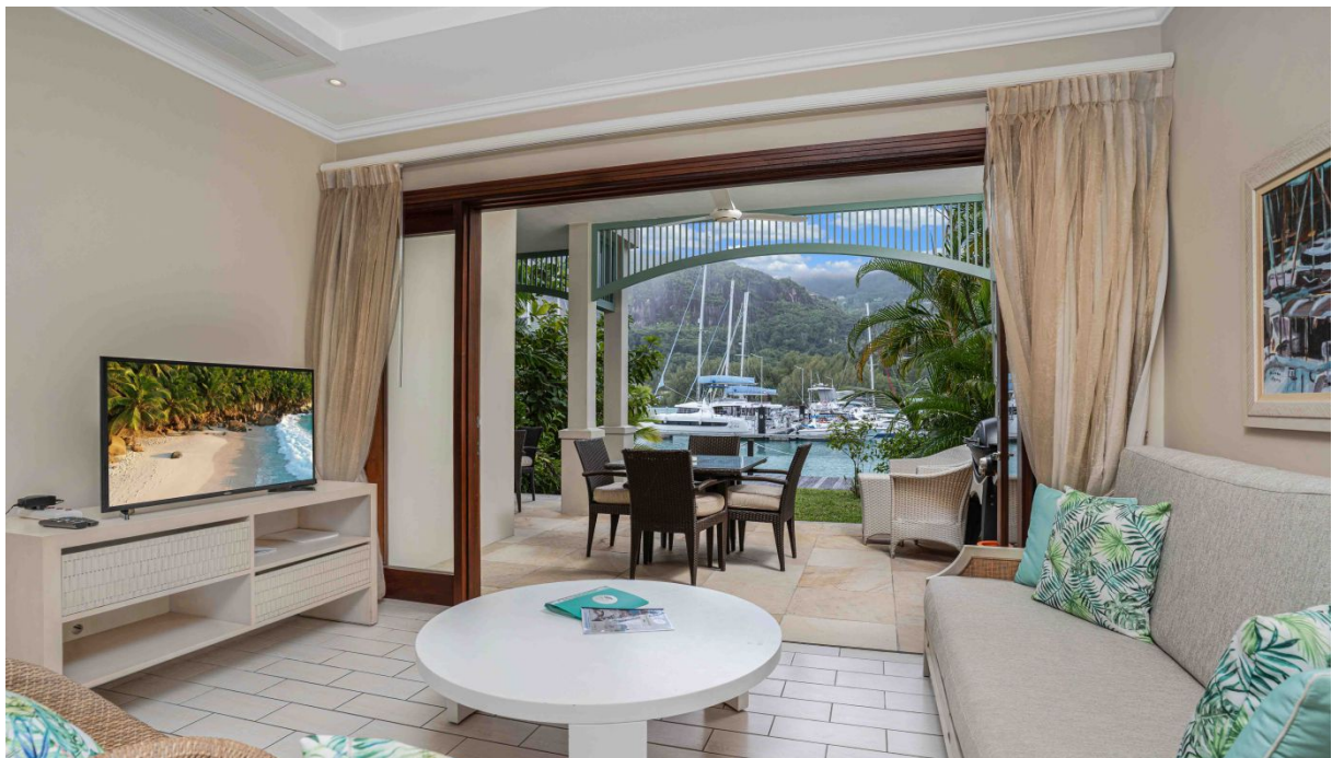
Apartment and boat mooring location

(5% Stamp duty, 1.5% Sanction Application Processing Fee, 1.5 % Notary Fee)