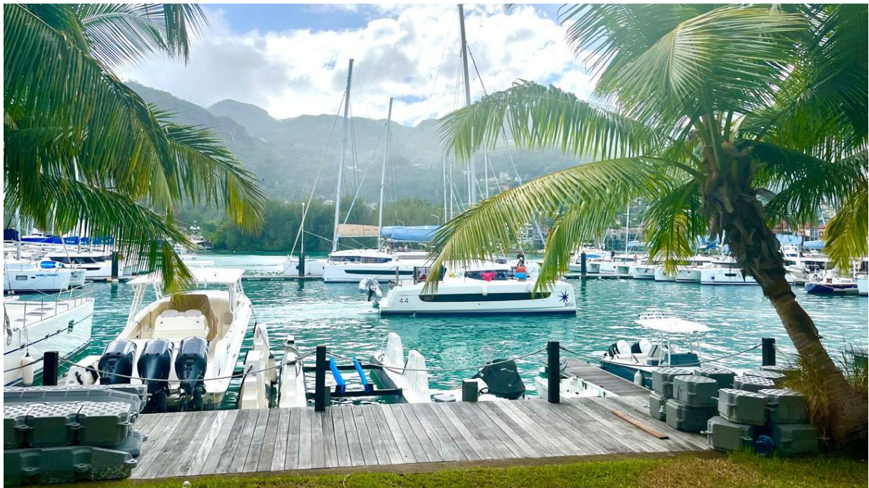
Apartment and boat mooring location

(5% Stamp duty, 1.5% Sanction Application Processing Fee, 1.5 % Notary Fee)