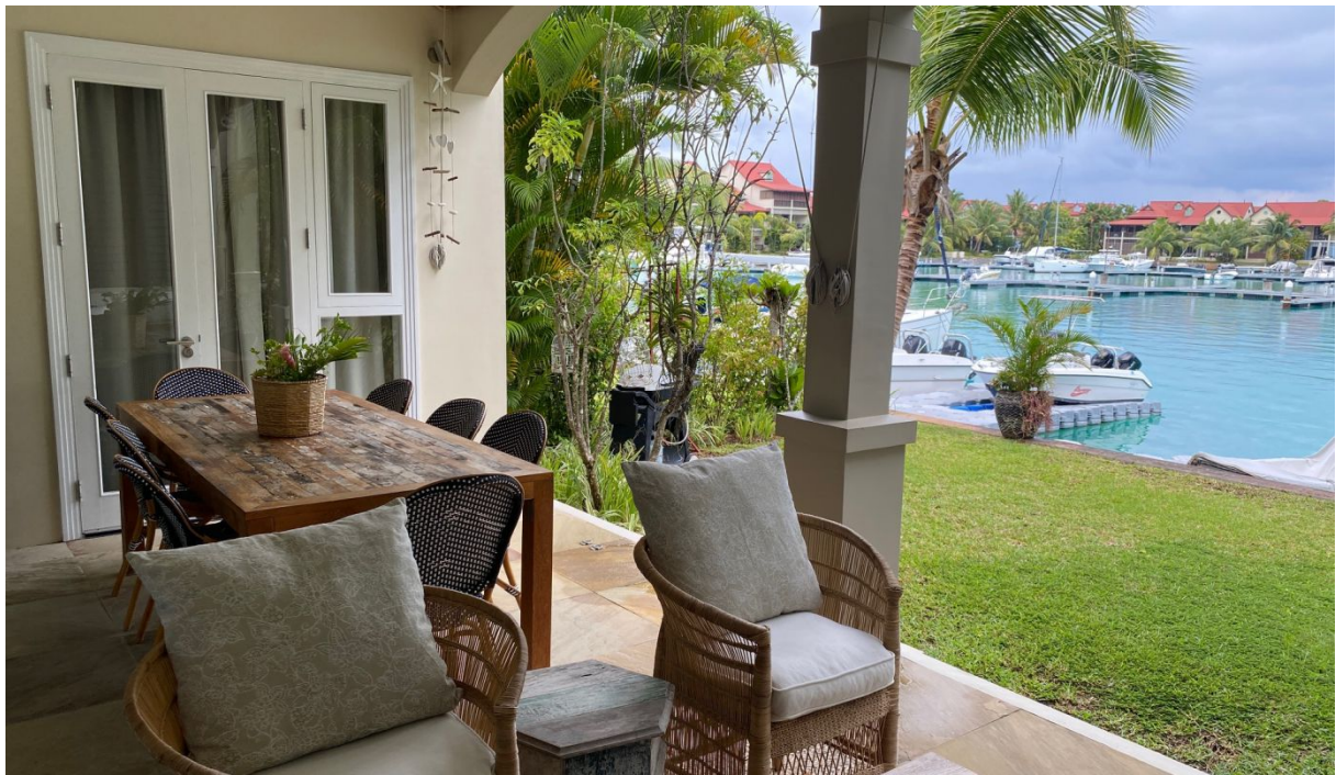
Location on Eden Island

(5% Stamp duty, 1.5% Sanction Application Processing Fee, 2 % Notary Fee)