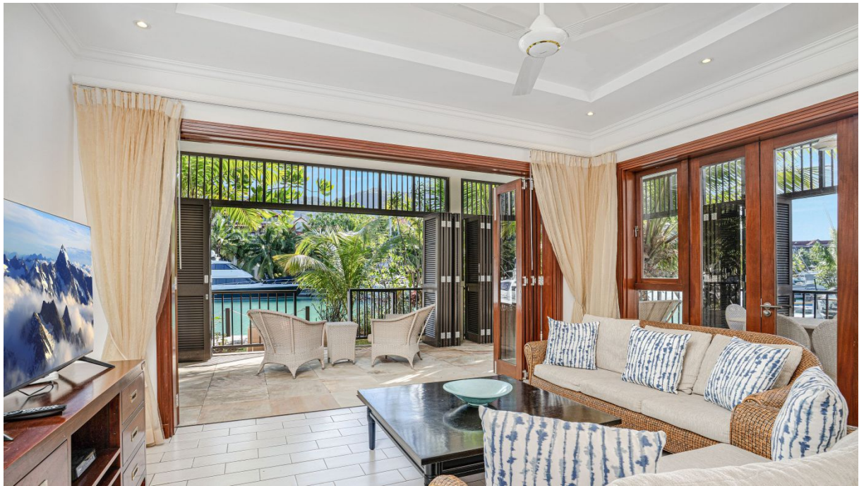
Maison and boat mooring location

(5% Stamp duty, 1.5% Sanction Application Processing Fee, 1.5 % Notary Fee)