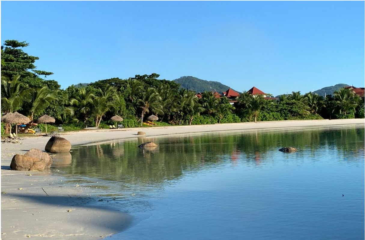
Anse Bernitier beach (approx. 1 minute walk from the maison)