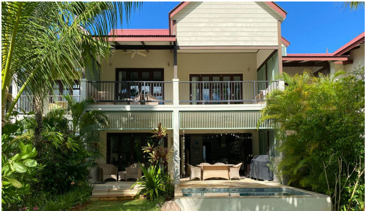
Location on Eden Island

(5% Stamp duty, 1,5% Sanction Application Processing Fee, 2 % Notary Fee)