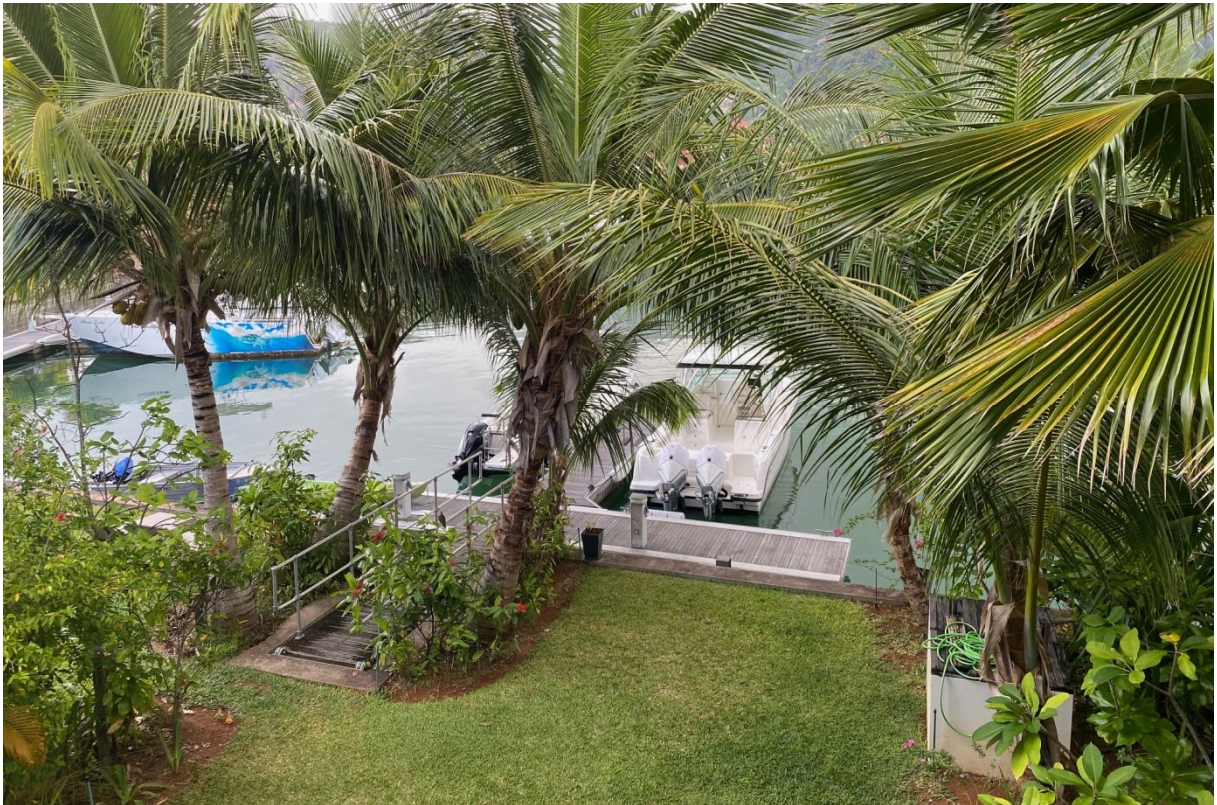
Anse Bernitier beach (approx. 4 minutes walk from the maison)