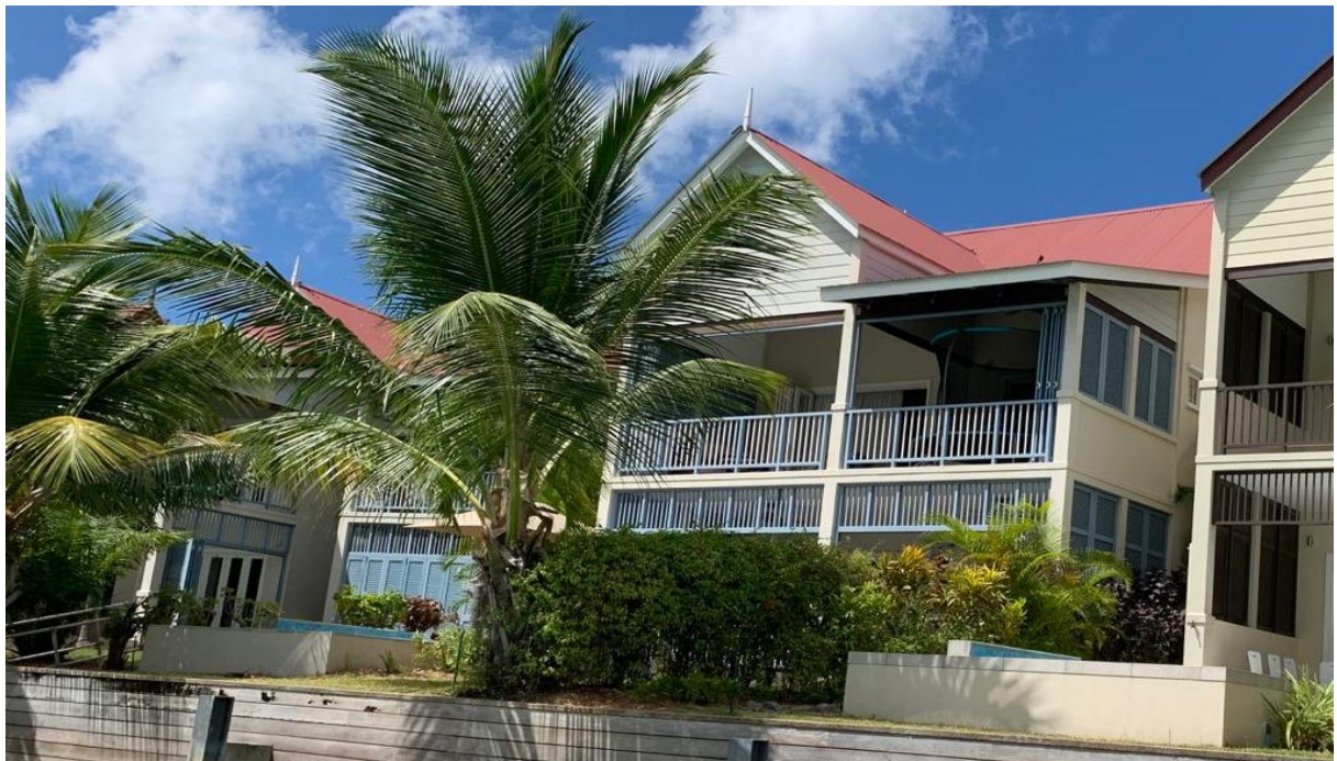
Location on Eden Island

(5% Stamp duty, 1.5% Sanction Application Processing Fee, approx. 1.5% Notary Fee)