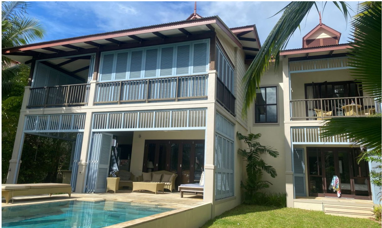
Location on Eden Island

(5% Stamp duty, 1.5% Sanction Application Processing Fee, 2 % Notary Fee)