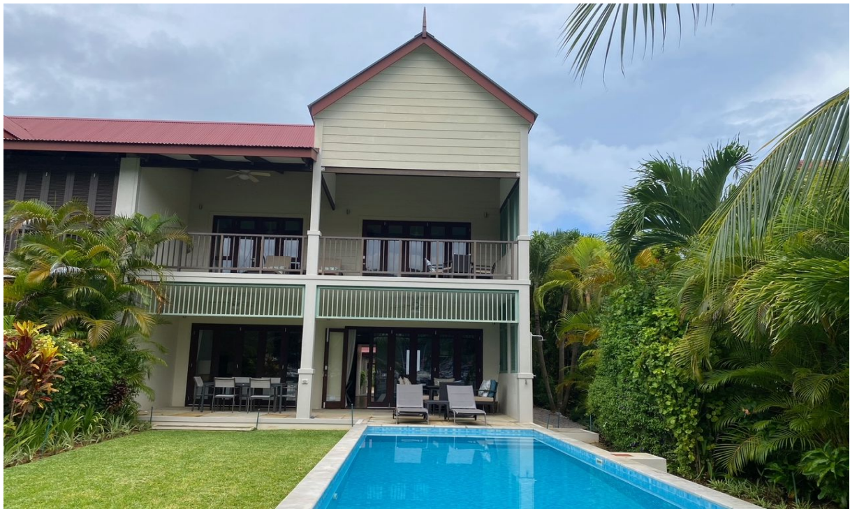
Location on Eden Island

(5% Stamp duty, 1.5% Sanction Application Processing Fee, 2 % Notary Fee)