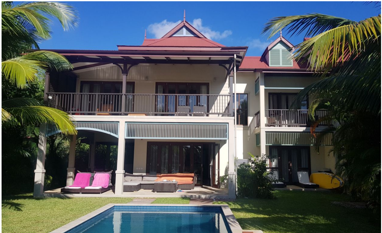
Location of the maison on the beach Anse Bernik