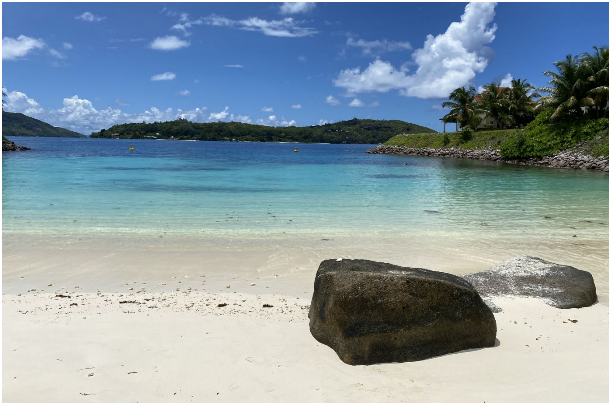
Anse Bernik beach (approx. 1 minute walk from the villa)