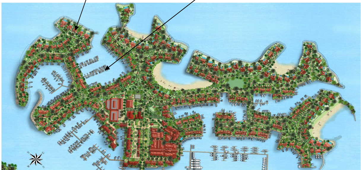
Boat mooring location