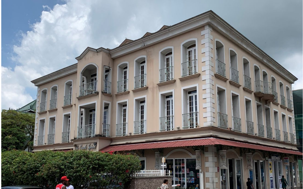
Location of the building