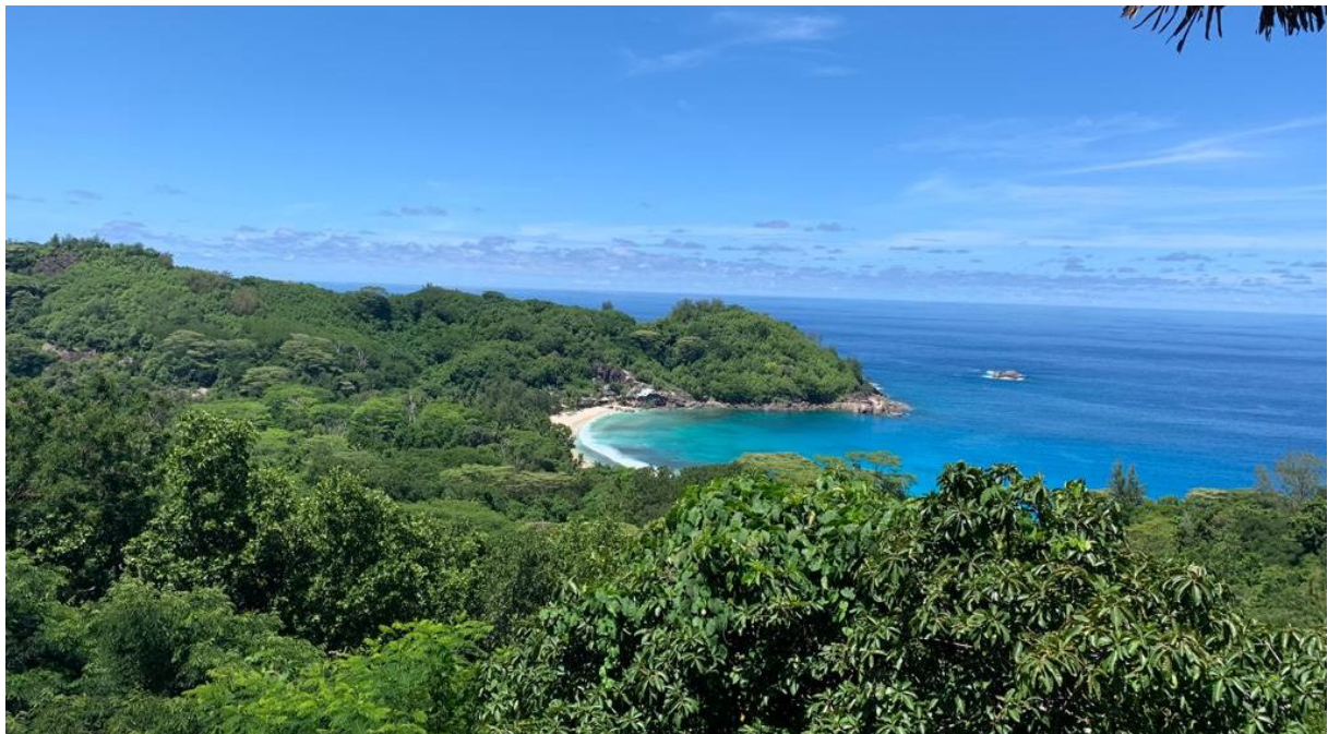
Location of property

Price from: EUR 350,000 + transfer taxes