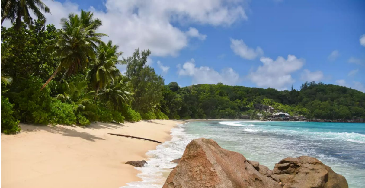
Anse Intendance beach (approx. 5 km from the property)