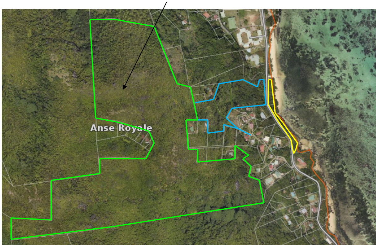
Anse Baleine beach

Plot P3 with total area of 194 604 m 2 can be purchased and added to plots P1 and P2 (the only access to the plot P3 is through the plot P2)