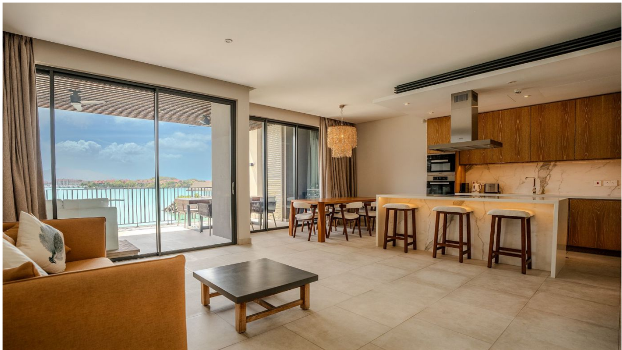
Apartment location in Pangia Beach

Price: USD 695,000 + 10 % transfer taxes (The price includes all apartment equipment.)