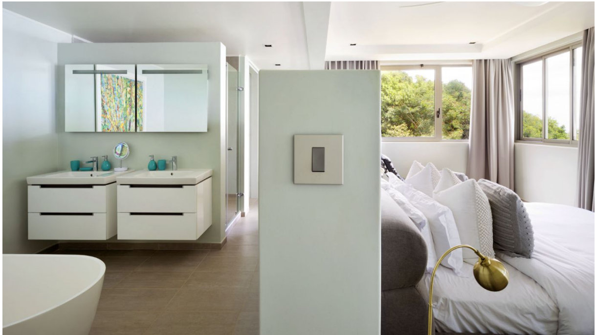
Entrance to the Royal Palm Residences