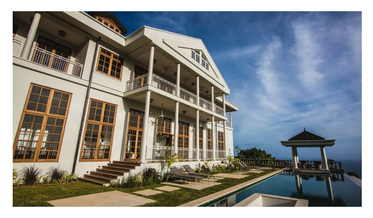
Location of Villa Palladio in Royal Palm Residences

Location: resort Royal Palm Residences, north-eastern coast of the main island of Mahé Total plot area: 4,568 m², residential surface area: 3,050 m² The plot includes: 6-bedroom villa, landscaped garden, swimming pool Price: USD 13,000,000 + transfer taxes