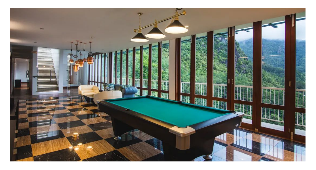
Entrance to the Royal Palm Residences