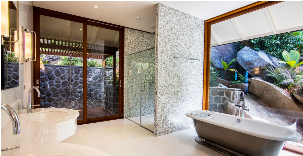
Entrance to the Royal Palm Residences