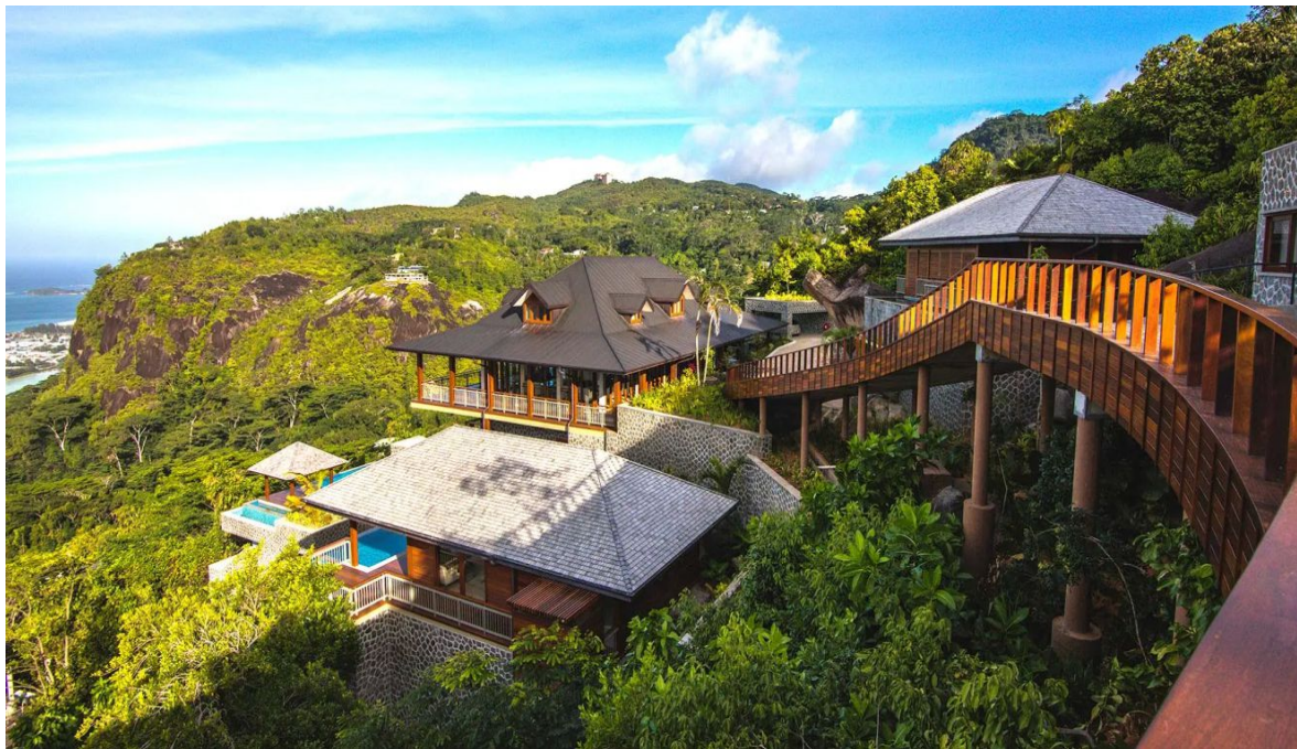
Location of Villa Salazie in Royal Palm Residences