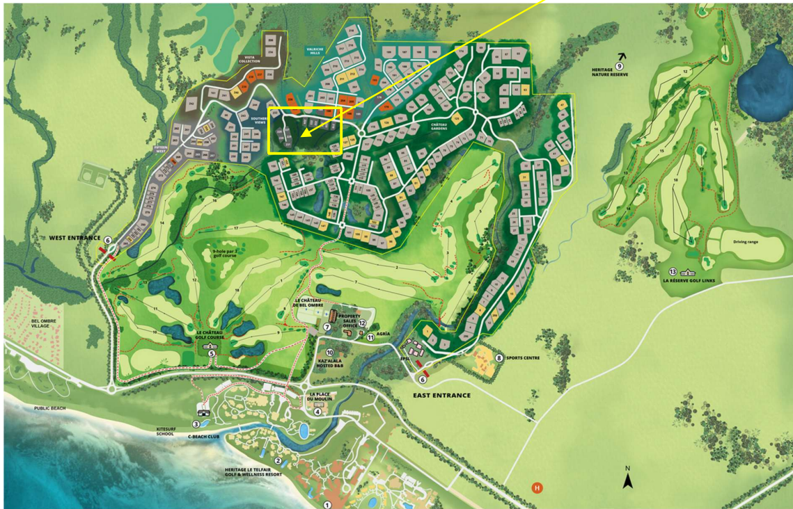
Type A Villas